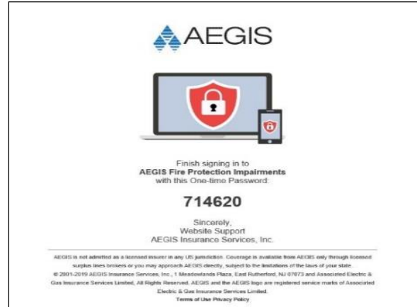
One-time Password (OTP)

You will need an OTP every time you want to log in to the system; it will be a different code each time. Once you enter the code, click Submit . You will be logged into the system and directed to the appropriate page based on your initial selection.